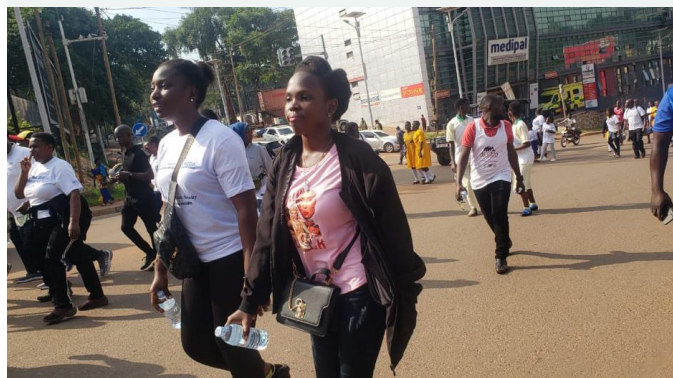
Students participating in the annual NCD prevention event

The NCDCA thanked the students for their participation in the event. They said that the students' involvement was essential to raising awareness about NCDs and encouraging people to adopt healthy lifestyles. The event was a success and helped to raise awareness about NCDs in Uganda. The students who attended the event learned valuable information about how to prevent NCDs. They are now better equipped to make healthy choices that will improve their own health and the health of their loved ones